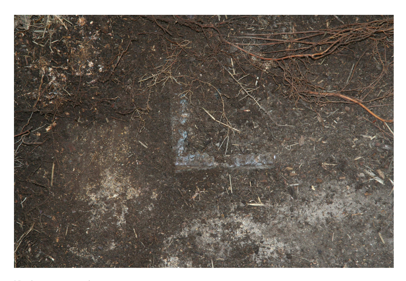
Northwest tower stub.