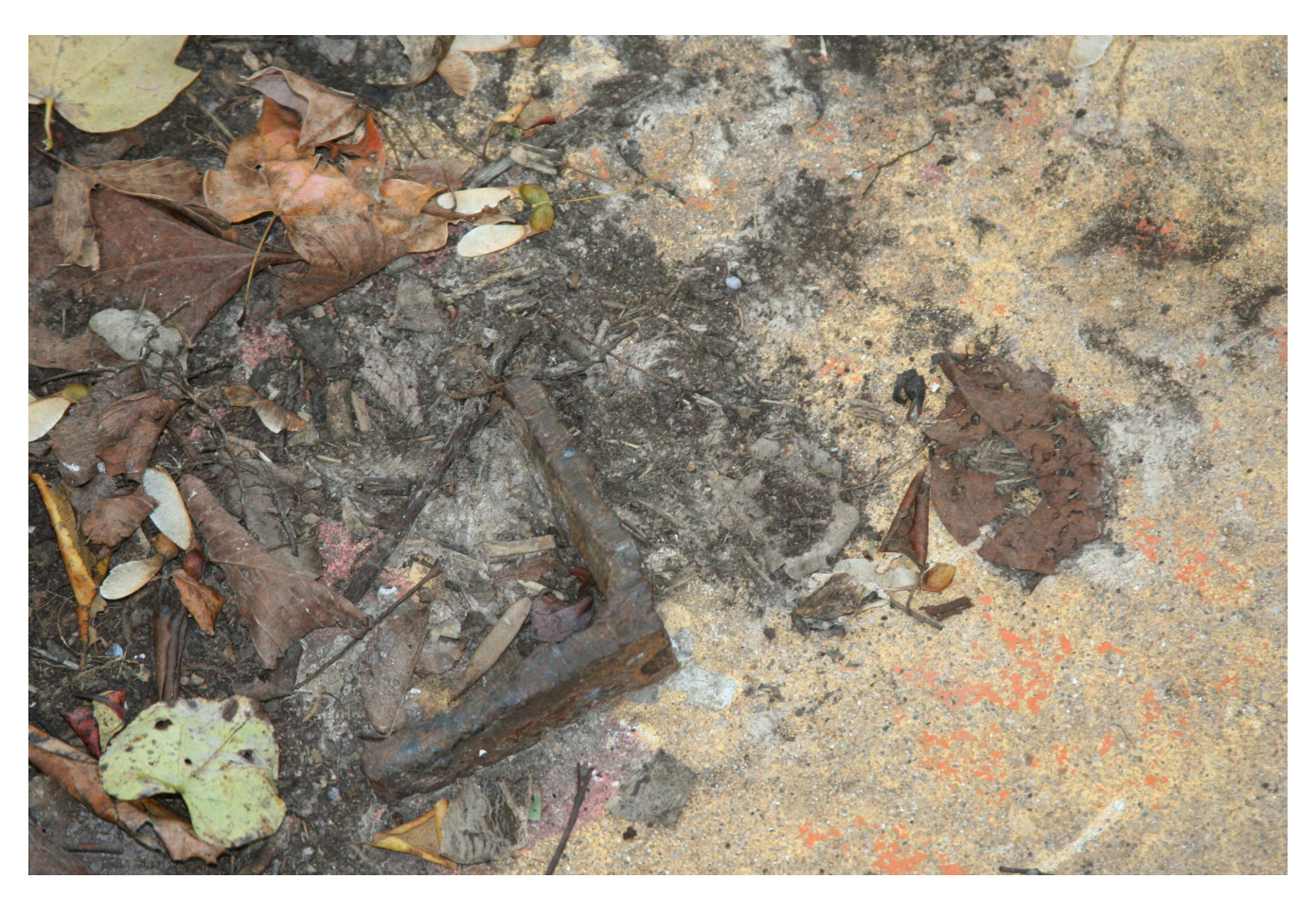
Remains of southwest tower leg.