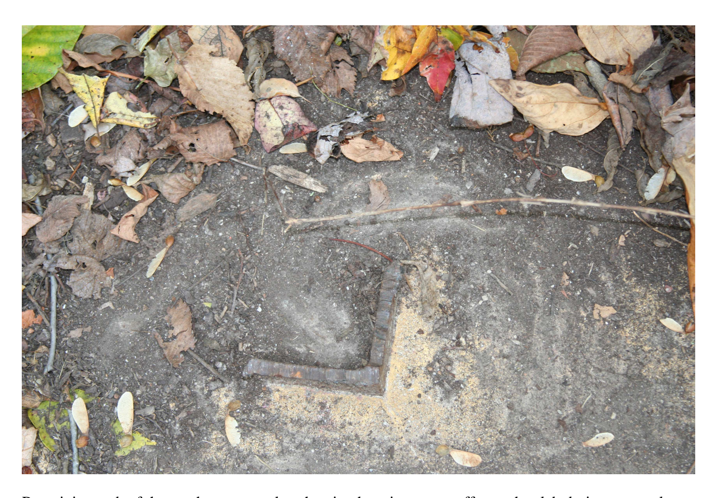
Remaining stub of the southeast tower leg showing how it was cut off near the slab during removal.

I did not find any trace of the northeast tower stub, but it may have been cover by plant debris or it is possible the slab was poured after tower construction and the missing stub is not covered by the slab. I hope to return to this site soon and clean off the slab and try to find the northeast stub and study any other artifacts present.