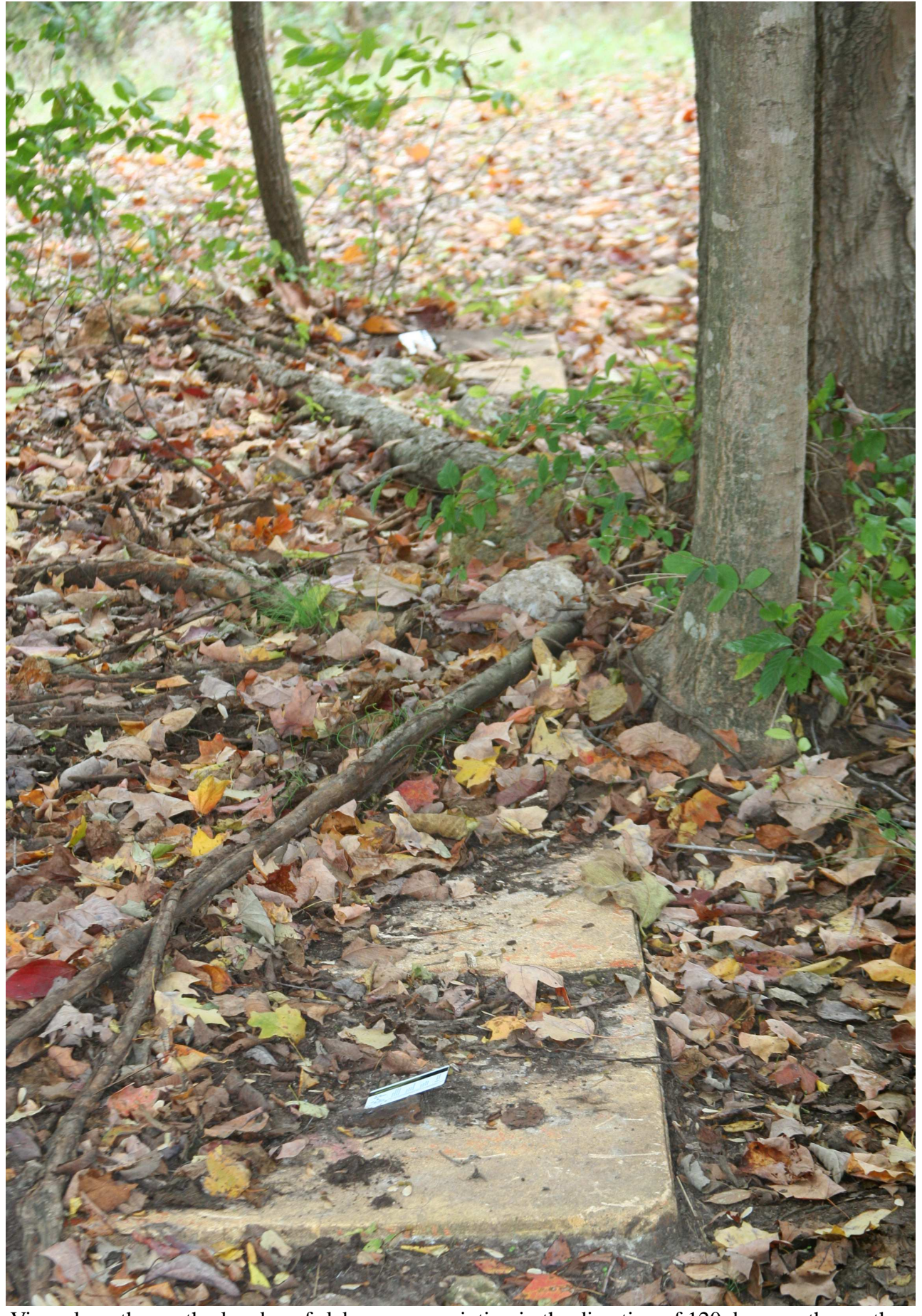
View along the southerly edge of slab, camera pointing in the direction of 120 degrees, the southeast and southwest stubs are marked with white cards.