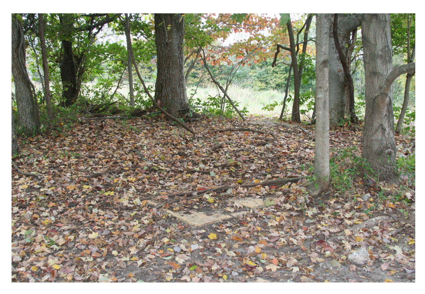
Southwest corner of the Beacon 70 foundation slab. Clump of trees in the left background may have been the location of a generator shack if one was installed. Since the site was adjacent to a county road power was likely from a commercial line.